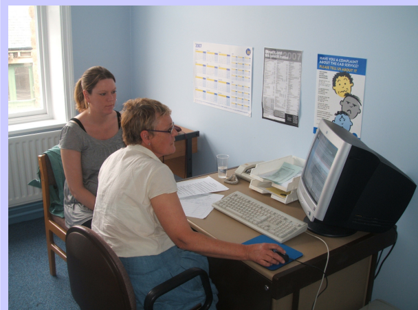
Advice giving in one of our 12 purpose-built interview rooms.

South Kirklees CAB moved in October 2006. We have refurbished 5300 sq ft of the vacant 2 nd floor of Standard House, Half Moon Street, which is close to the bus and rail stations in Huddersfield. Kirklees Benefits Advice Service (KBAS) rent space in our offices and CHAS Housing Aid are on the floor below, creating a one stop shop for advice . Access is via the central arcade using the lift or stairs. Our facilities are DDA compliant throughout.